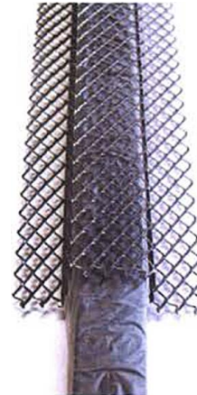
MASTERSTOP bentonite swelling tape xx/xx black and green MASTERSTOP LONG TIME with grid for fixing